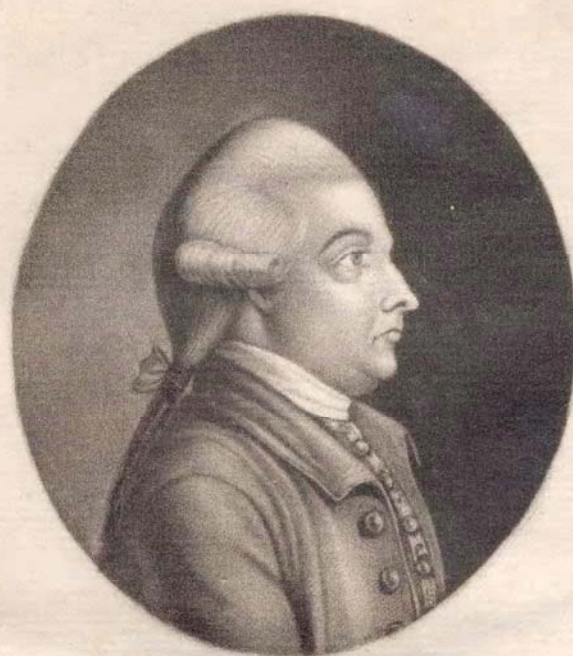
Capt. JONATHAN CARVER.